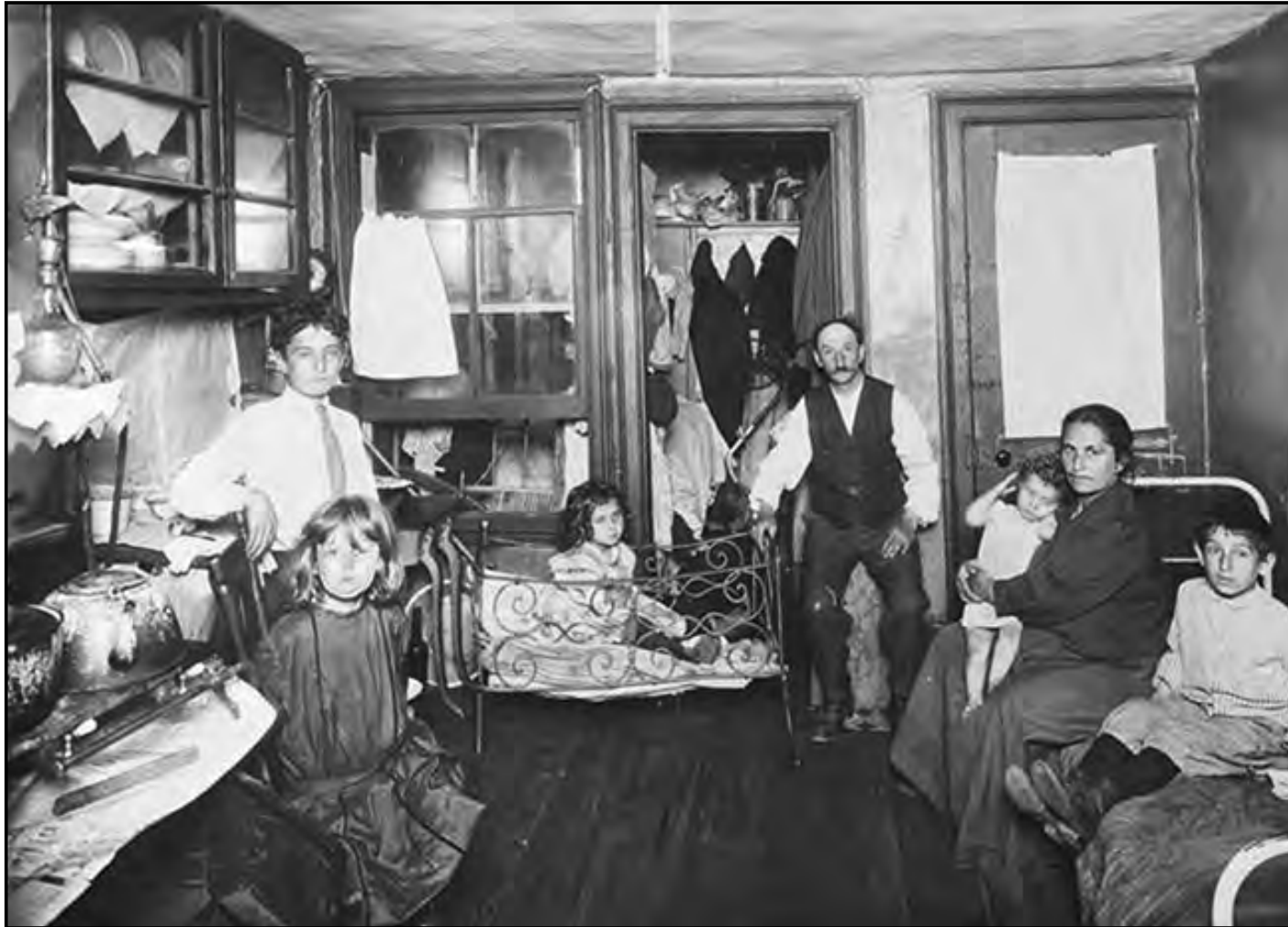
Source: Jacob Riis, How the Other Half Lives: Studies Among the Tenements of New York , Dover Publications, 1971