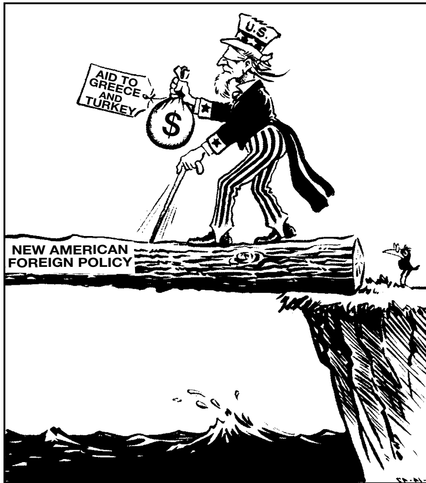
Source: Fred O. Seibel, Richmond Times-Dispatch , March 14, 1947 (adapted)