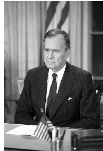
President George H. W. Bush