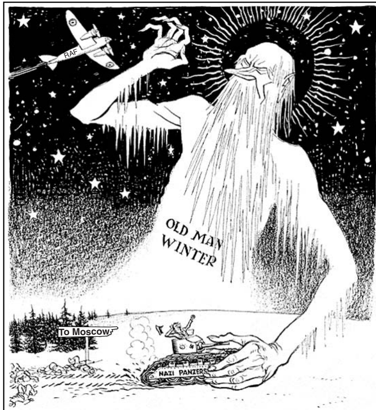
Old Man Winter