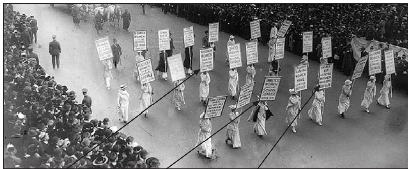
Suffragists' Parade, c. 1913