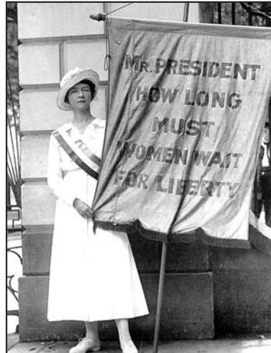
White House Picketeter, 1917