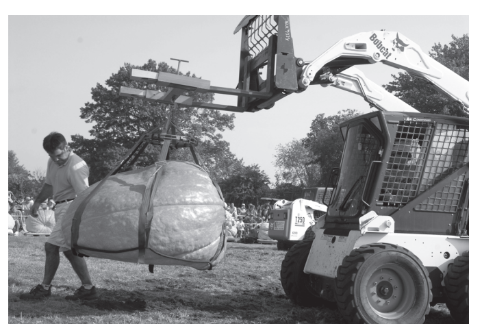
At a pumpkin contest in Rhode Island, a pumpkin is transported for weighing.