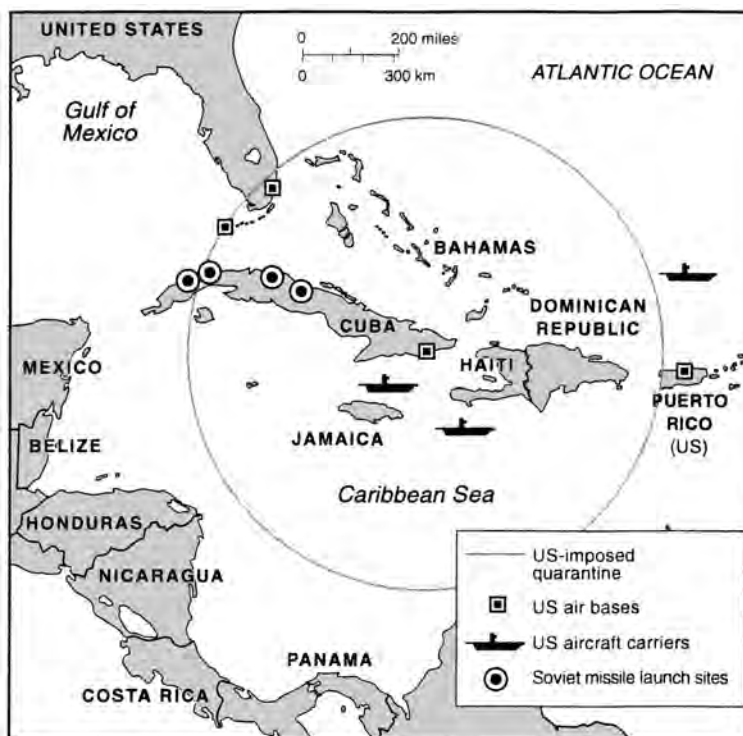
Cuba under Castro, 1962