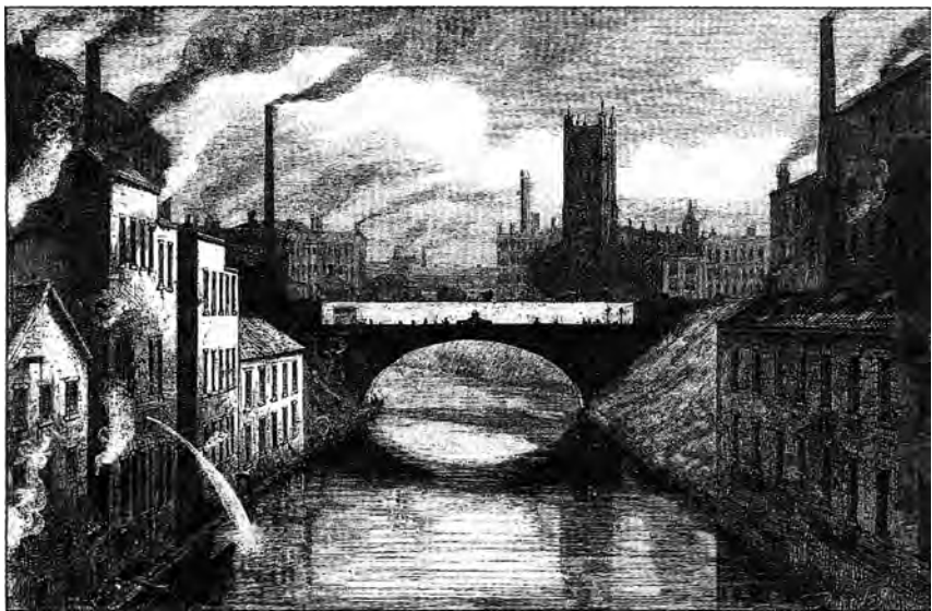
The Blackfriars Bridge is in Manchester, England, over the Irwell River.