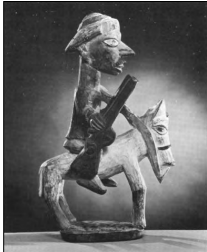
Source: Leon E. Clark, ed., Through African Eyes , Praeger, (adapted)