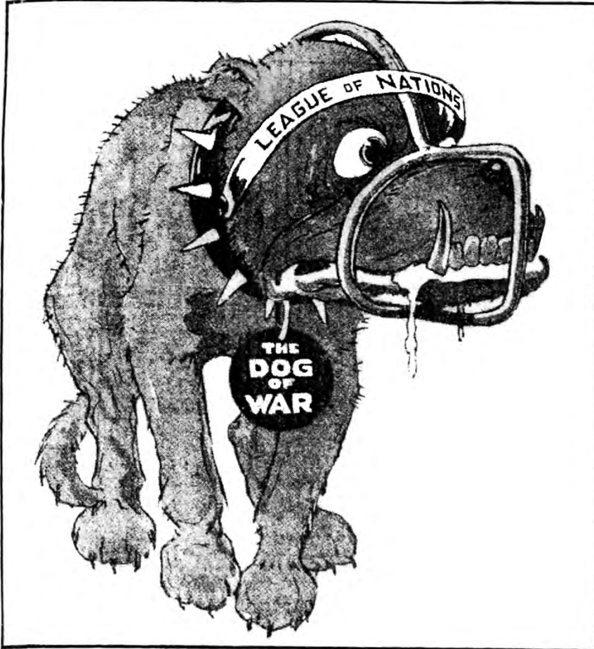
Source: London Opinion , reprinted in Literary Digest , September 13, 1919 (adapted)