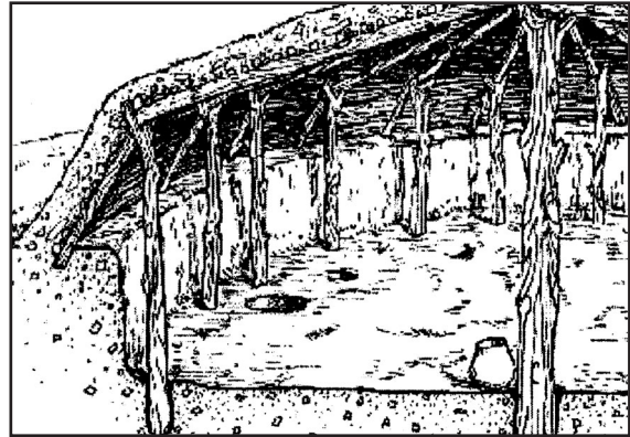
Native American Dugout

At first, colonists had to make do with temporary shelters. English wigwams were dome-shaped structures patterned after the homes of Algonquian Indians. These homes had one room with dirt floors and a very low doorway. Dutch settlers often built dugouts, which were pits dug into the side of a hill or the ground. Eventually, all of these temporary homes gave way to more permanent homes.