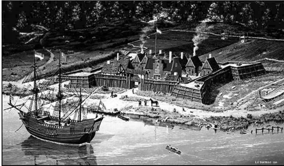
Source: Painted by L. F. Tantillo, "Fort Orange," www.lftantillo.com

Some settlements were started near early forts, which were located by rivers or lakes. There were few roads for settlers to use, so water transportation made travel easier. The rivers and lakes were also an excellent source of food and fresh water.