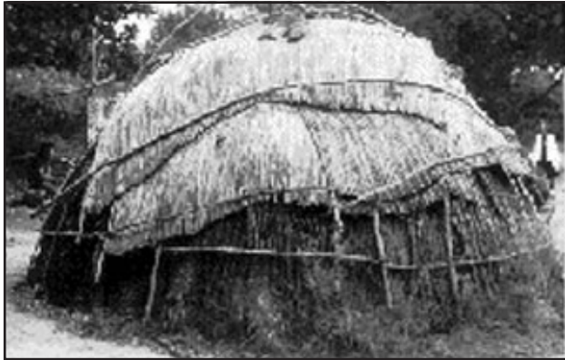
Native American Wigwam