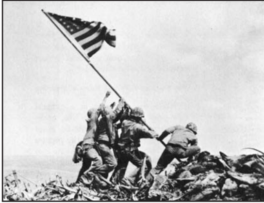
United States marines raised the flag at Iwo Jima (a famous battle) during World War II, 1945.

Raising our flag is a symbol of our country and our freedom. The flag has been raised in battle, at events symbolizing our accomplishments, and lowered during times of great sadness. It reminds us of the sacrifices and achievements many people have made for our country.