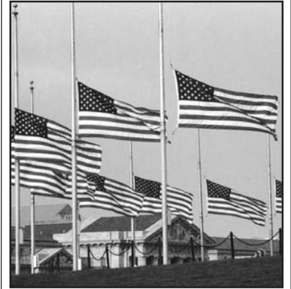
Flags are flown at half-staff to honor someone who has died, such as an American president.