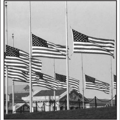
Flags are flown at half-staff to honor someone who has died, such as an American president.