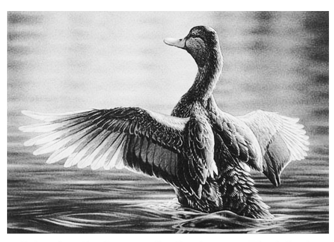
Adam's winning work of art—a mottled duck

Federal Migratory Bird Hunting and Conservation Stamps are commonly called "Duck Stamps." These pictorial stamps are produced by the U.S. Postal Service for the U.S. Fish and Wildlife Service; however, they are not valid for use as postage. Each waterfowl hunter is required to purchase a stamp and carry it along with a hunting license.