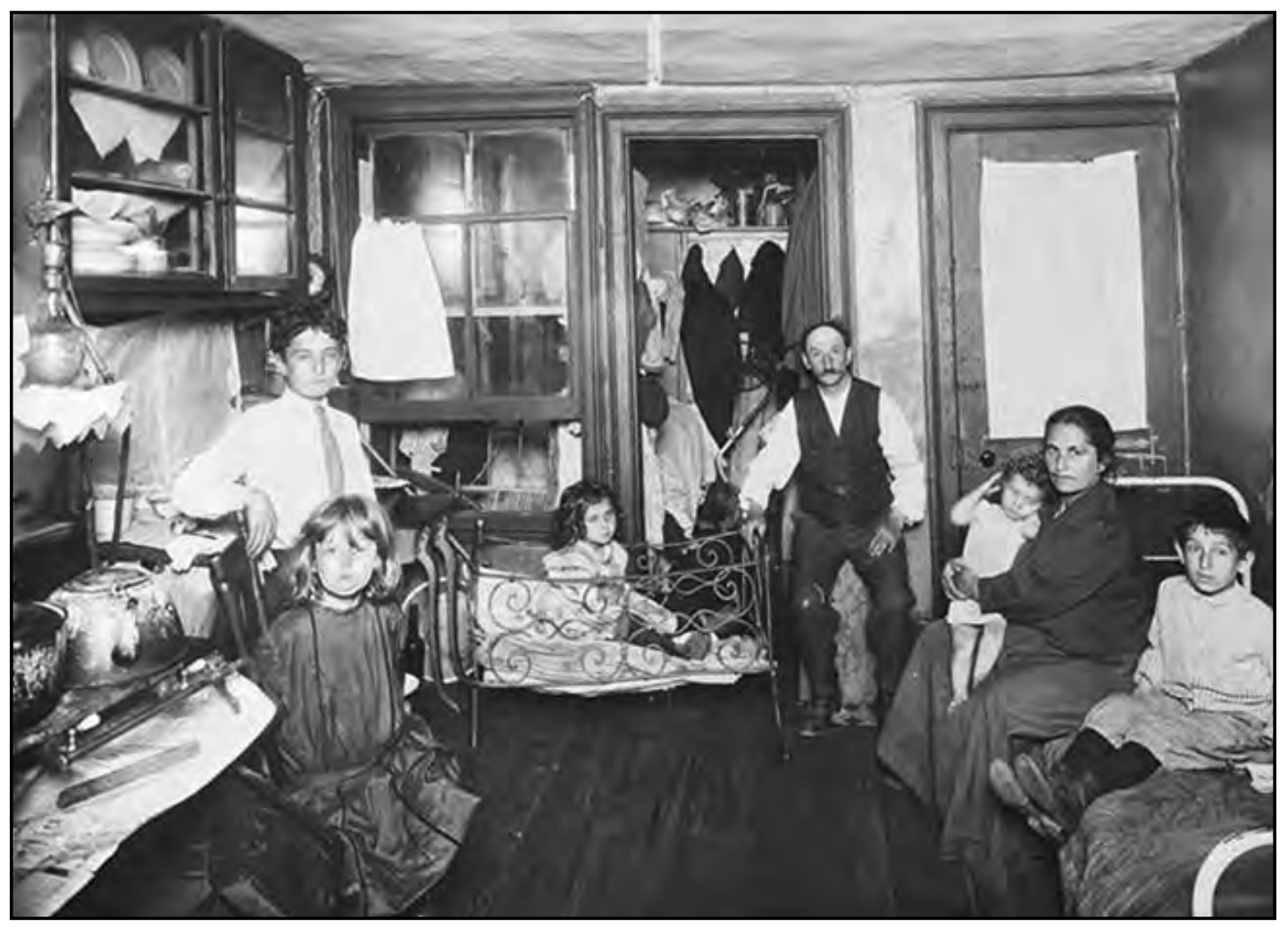
Source: Jacob Riis, How the Other Half Lives: Studies Among the Tenements of New York , Dover Publications, 1971