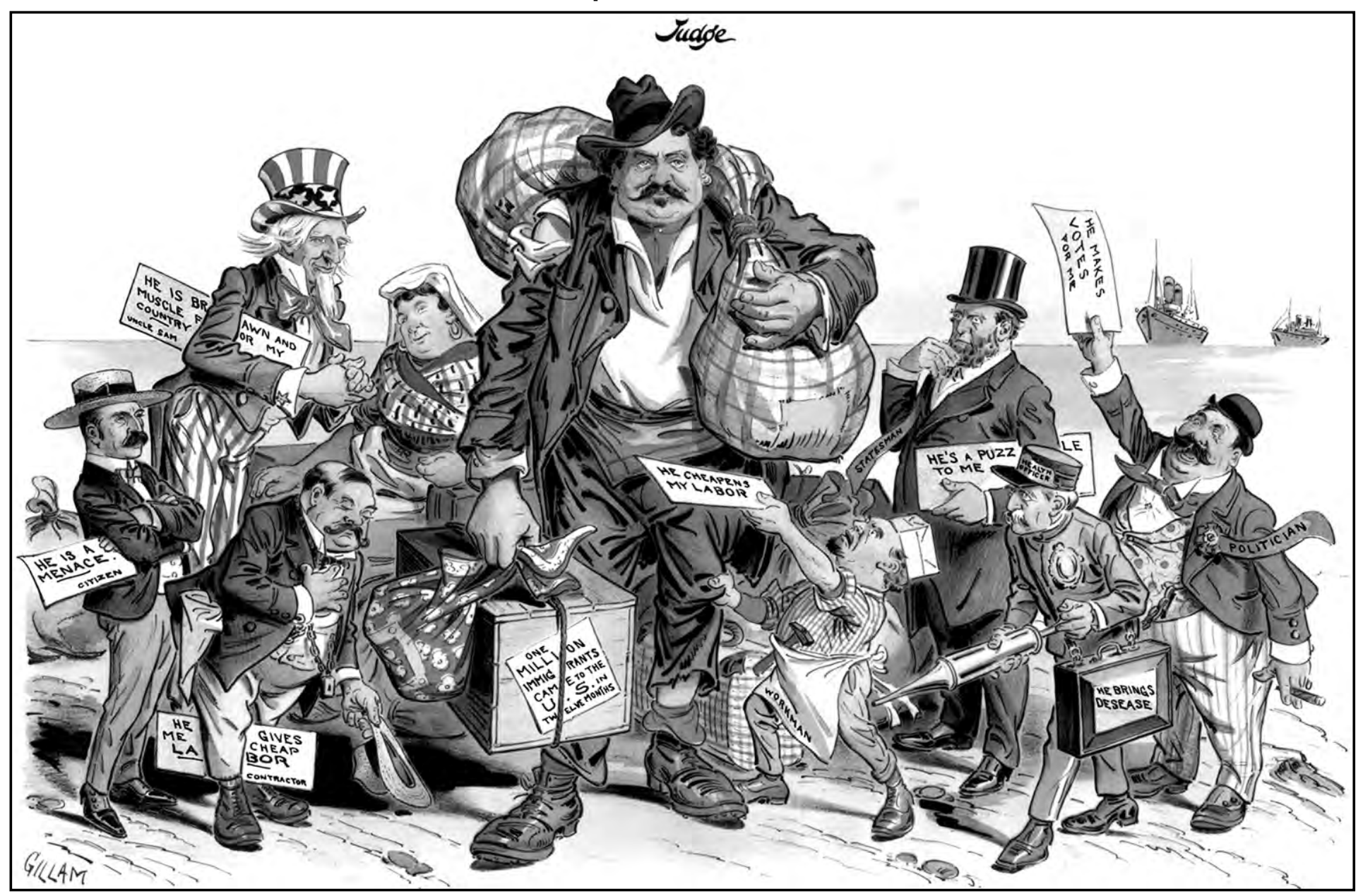
"THE IMMIGRANT. Is he an acquisition or a detriment?"

Base your answer to question 25 on the cartoon below and on your knowledge of social studies.