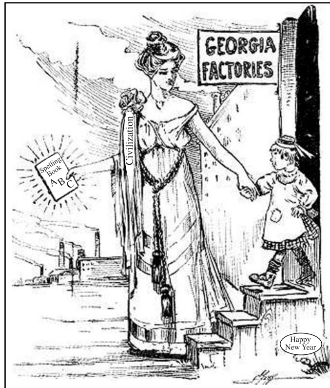
The State of Georgia welcomes the operation of the new Child Labor Law.

Source: L. C. Gregg, Atlanta Constitution , 1907 (adapted)