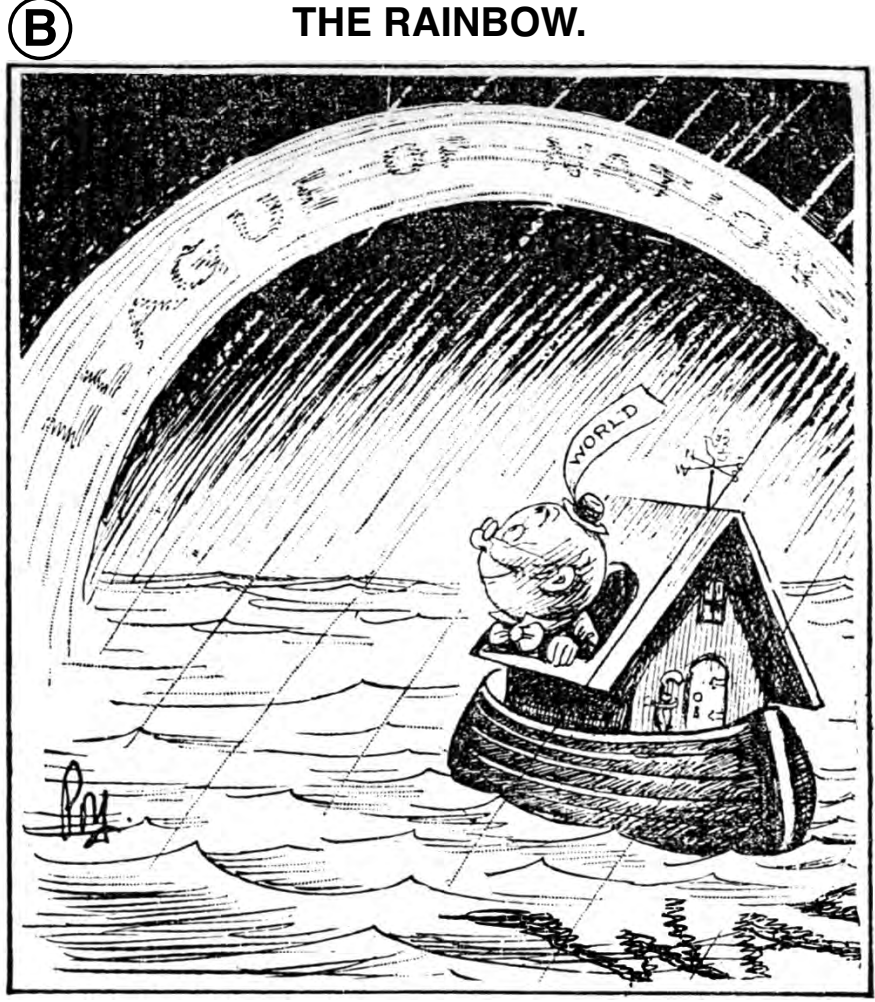
Source: London Evening News, reprinted in Literary Digest, September 13, 1919 (adapted)