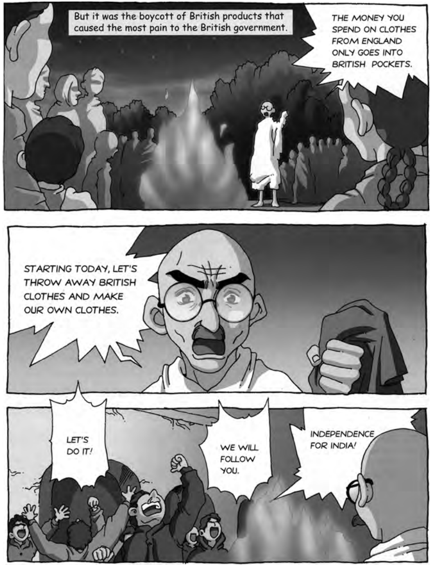
Source: Y. kids, Great Figures in History: Gandhi, YoungJin Singapore