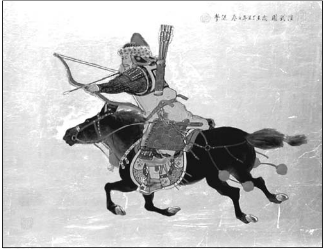
Source: Mou-Sien Tseng, painting, New Masters Gallery online (adapted)