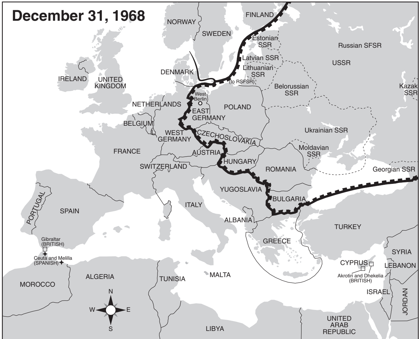
Source: Colin McEvedy, The New Penguin Atlas of Recent History: Europe Since 1815 , Penguin Books (adapted)

Base your answers to questions 36 and 37 on the map below and on your knowledge of social studies.