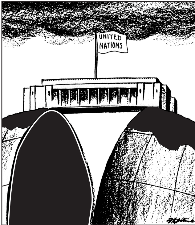
The Meeting Will Now Come To Order

Base your answer to question 38 on the cartoon below and on your knowledge of social studies.