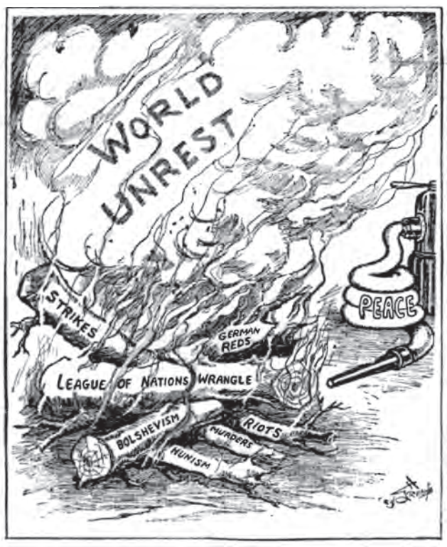
TURN ON THE HOSE

Base your answer to question 26 on the cartoon below and on your knowledge of social studies.