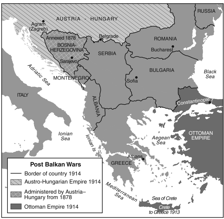
The Eastern Question and the Balkans