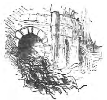
This is the sewer, from cesspool and sink, That feeds the fish that float in the ink--y stream of the Thames with its cento of stink, That supplies the water that JOHN drinks.