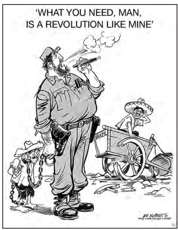
Source: Edmund S. Valtman, The Hartford Times , August 31, 1961 (adapted)

Base your answer to question 39 on the cartoon below and on your knowledge of social studies.