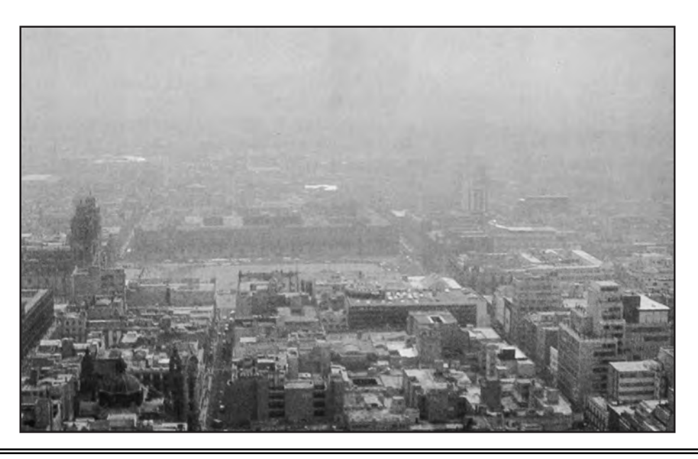
Source: Geography Theme Activities. Global Insights: People and Cultures. Glencoe/McGraw-Hill

... Mexico City residents once viewed the forest of smokestacks and their congested highways with pride. They saw these developments as symbols of modernization and proof of a growing economy. In recent years, however, air pollution has begun to have a serious impact on their lives. Several times during 1992, for instance, Mexico City's ozone level climbed well over the "very dangerous" point on the official index and remained there for days. Each time the government declared an emergency. Car use was restricted, and industries were required to cut back operations. One result of such events is that more and more people are beginning to equate the city's factories and cars with environmental destruction. . . .