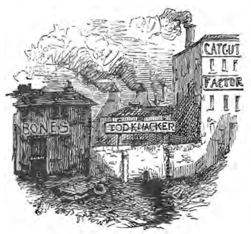
These are vested int'rests,** that fill to the brink, The network of sewers from cesspool and sink, That feed the fish that float in the ink--y stream of the Thames, with its cento of stink, That supplies the water that JOHN drinks.