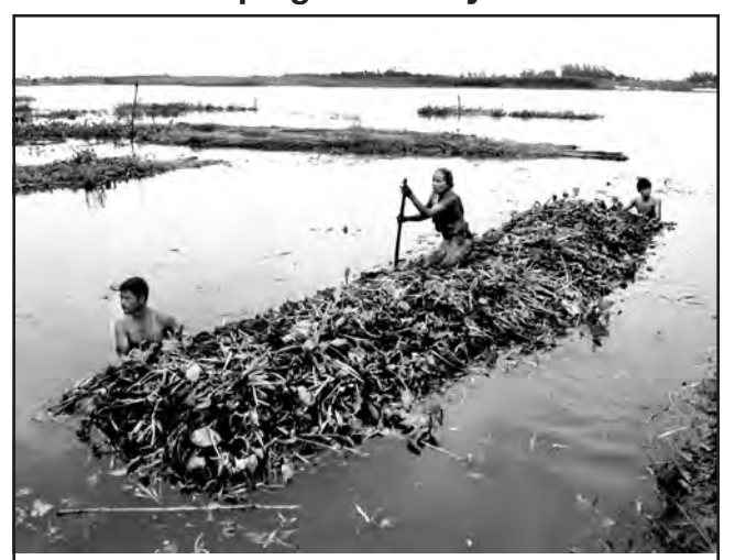
Enterprising island inhabitants in the Gaibandha District use hyacinth plants to create floating gardens, where they will plant squash, okra, and other food crops....

Source: Don Belt, "The Coming Storm," National Geographic, May 2011, Photograph by Jonas Bendiksen (adapted)