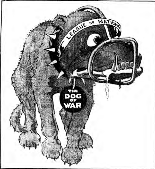
Source: London Opinion , reprinted in Literary Digest , September 13, 1919 (adapted)