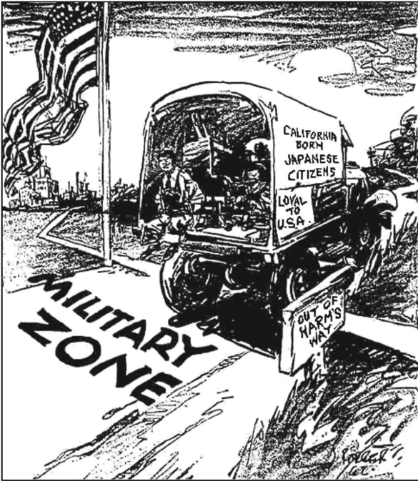
Source: Douglas Rodger, San Francisco News, March 6, 1942 (adapted)

Source: San Francisco News, editorial, March 6, 1942