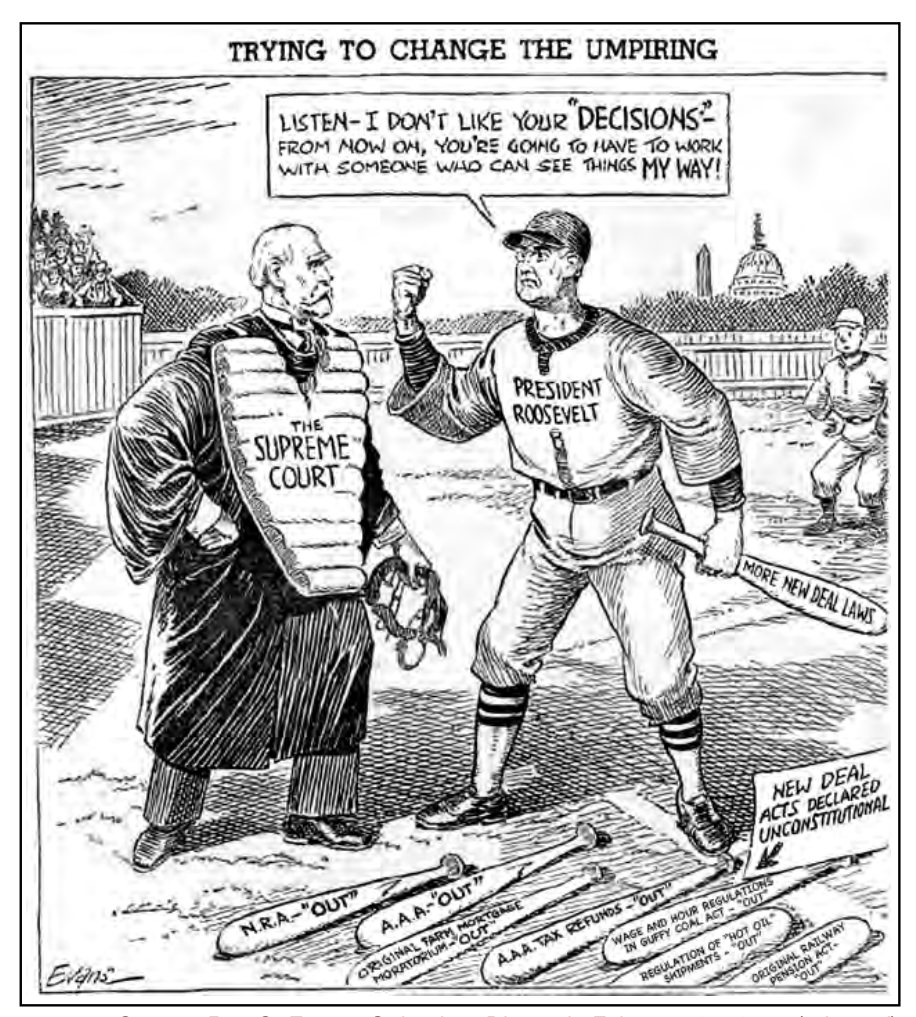
Source: Ray O. Evans, Columbus Dispatch, February 10, 1937 (adapted)