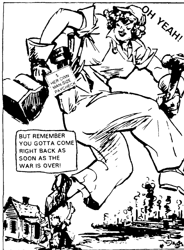
Rosie the Riveter Steps Out (adapted)

Base your answer to question 36 on the cartoon below and on your knowledge of social studies.